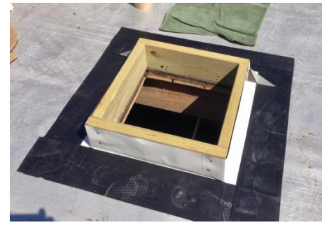
6) Install membrane over metal.