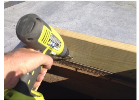
3) Fasten curb to roof.