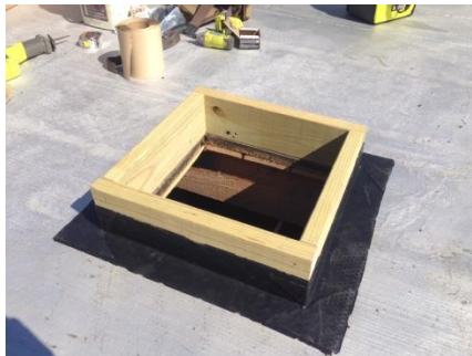
4) Flash curb with membrane.