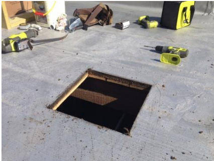
1) Cut 16 1/2" hole through roof.

NOTE: For best operation install solar fan where it will receive direct sunlight.