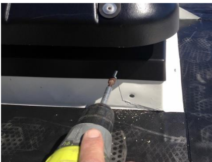
8) Fasten fan to curb.