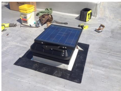
7) Mount fan to curb.