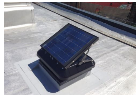
9) Coat flashing with roof paint.