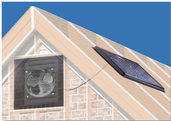
Model Shown: GBL 850 FT