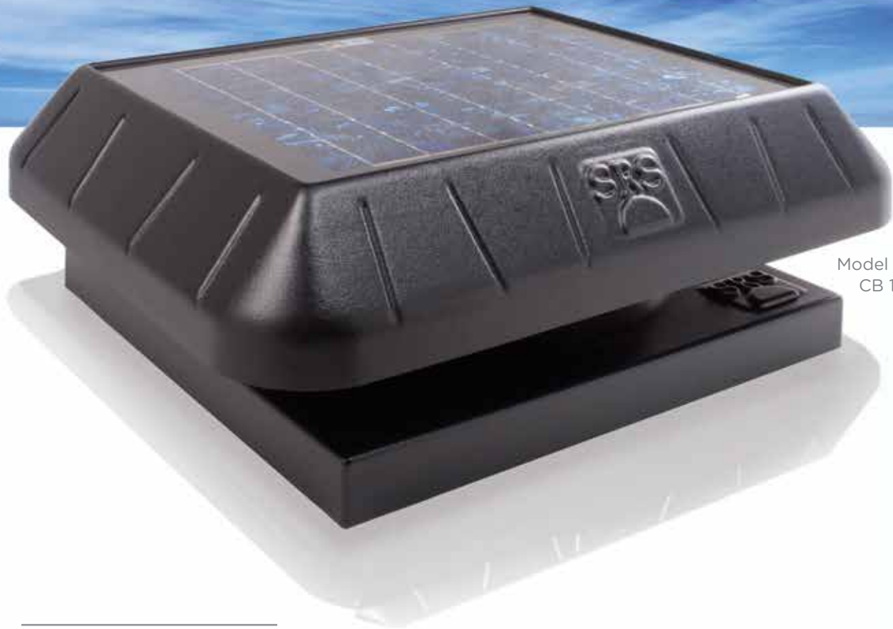
Model Shown: CB 1250 FT