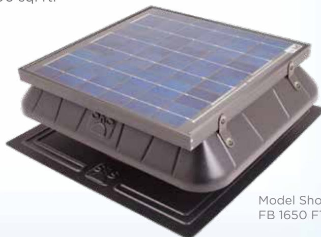
Model Shown: FB 1650 FT

SunRise 1650 FT - 45 Watt - For areas up to 2800 sq. ft.