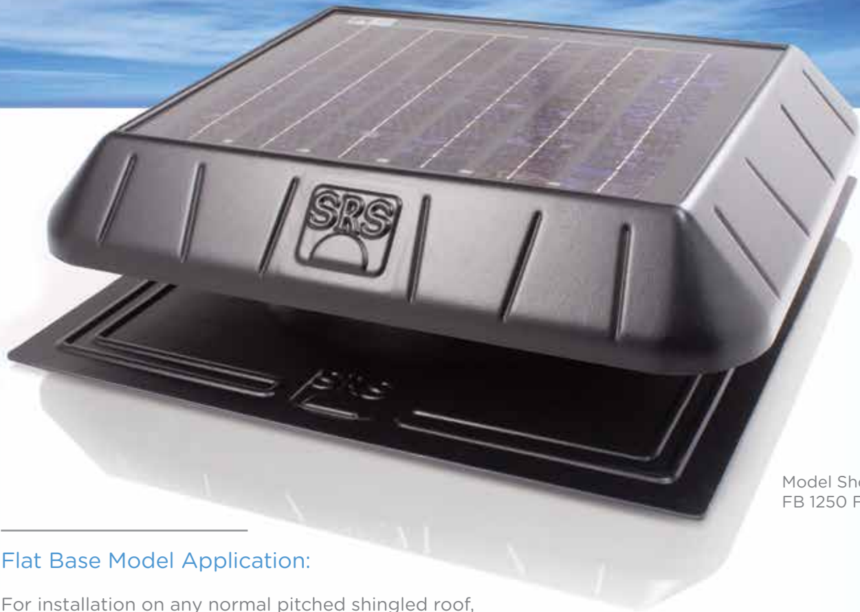
Model Shown: FB 1250 FT