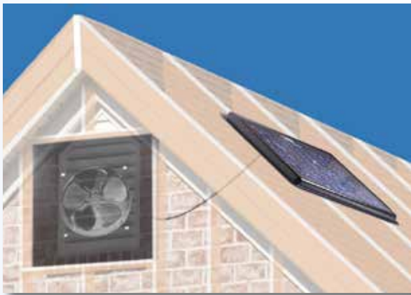
Model Shown: GBL 1250 FT